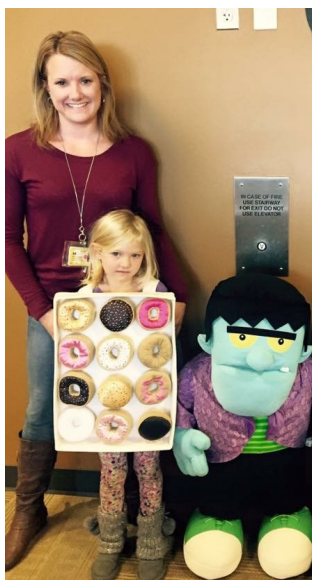
Another great Gen Med Halloween Party!